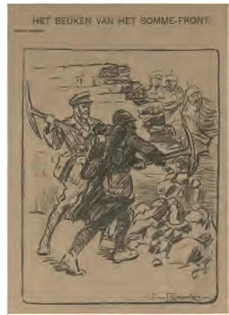
A cartoon by Raemaekers from De Telegraaf : 'Pounding away at the Somme front' (22 September 1916).

Raemaekers, the Greatest World War Cartoonist, Comes to the United States to Work for the New York American