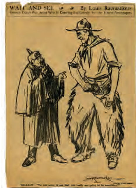
In America, Raemaekers would produce cartoons for the Hearst Press. Tens of millions of copies were printed each month.