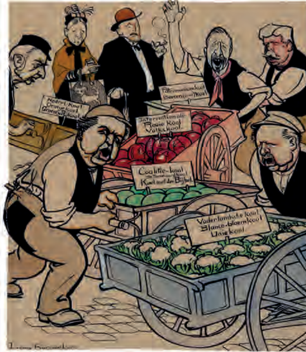
A cartoon about the Dutch Parliamentary elections in 1913 (13 July 1912).

Obituary of Louis Raemaekers from The Times , 27 July 1956.