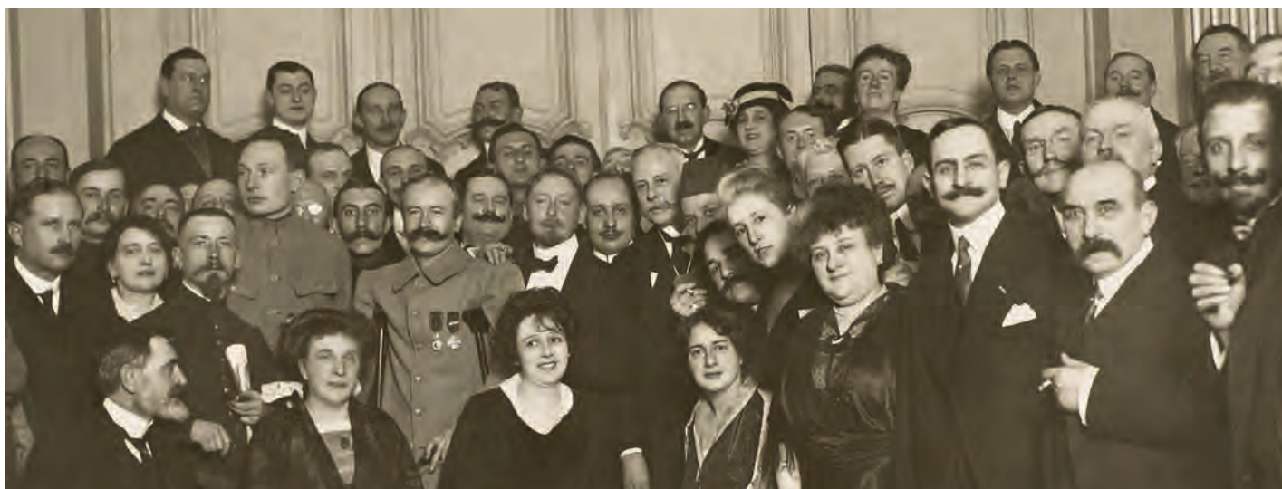
Raemaekers (centre, with black tie) surrounded by French cartoonists. Seated on the left is Théophile Steinlen (February 1916).