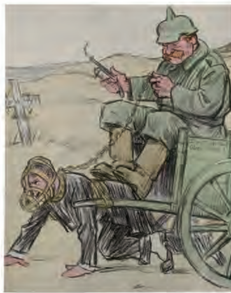
'Better a living dog than a dead lion', a print that made Raemaekers highly controversial in the Netherlands.