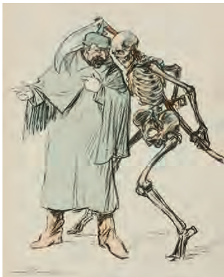
Two very different cartoons by Raemaekers: the symbolic alliance between Kaiser Wilhelm and Death and a gruesome depiction of the effects of poison gas (1917 and 1915).