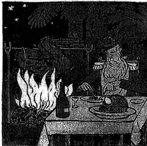
und so der Belgier.