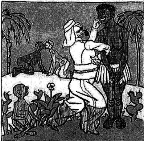
So der Italiener