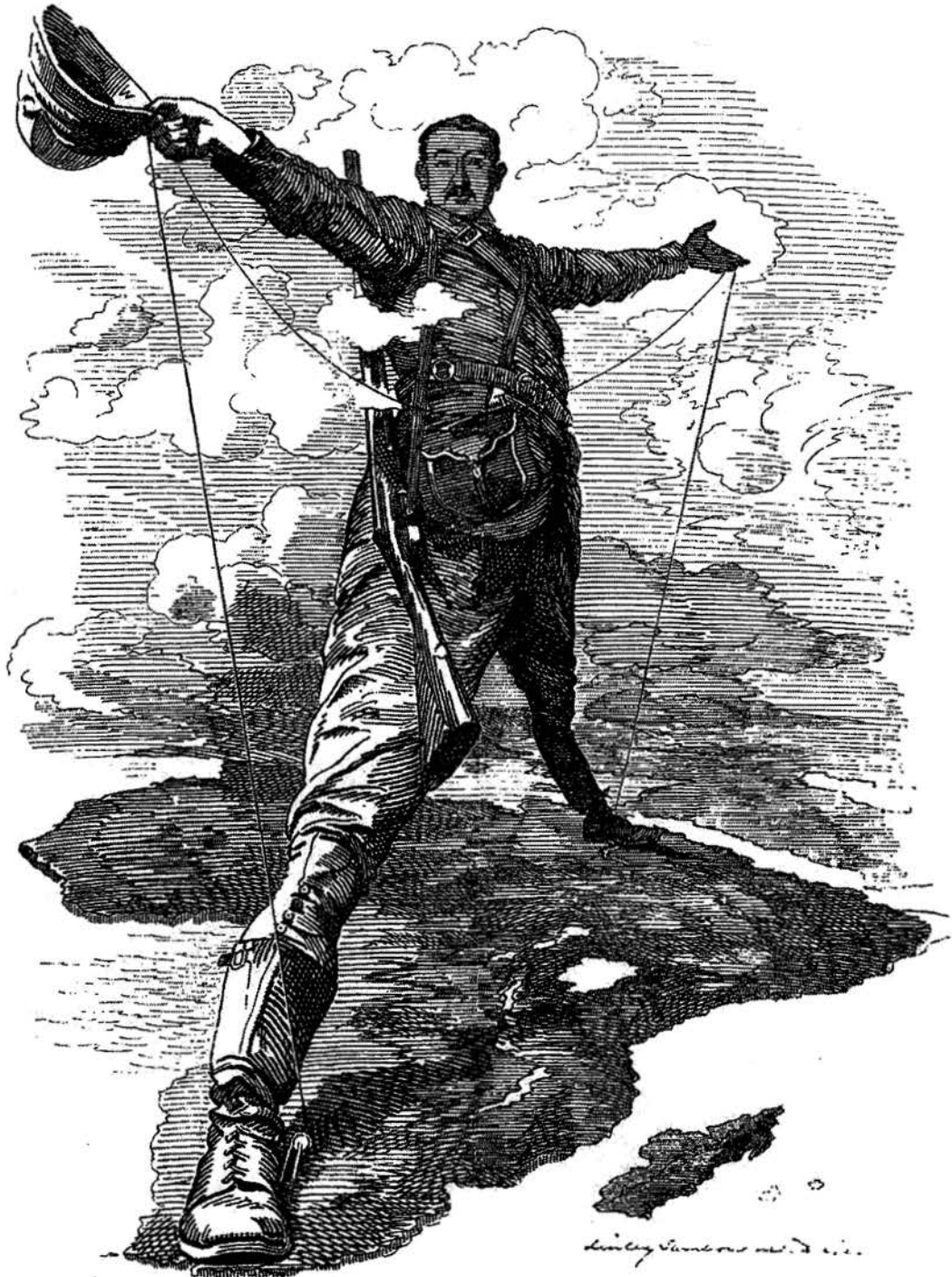
Fig. 1. Linley Sambourne. 1892. "The Rhodes Colossus." Punch . Dec. 10: 266.

Perhaps to date the enormity of the task -- including the sheer wealth of source-material, the variety of linguistic and cultural contexts, and the multiplicity of potential questions for analysis -- has been a stumbling-block to a coherent analysis of imperialism in cartoons. Like the ongoing effort to explore political cartoons as a global phenomenon (Scully, 2014), it seems unlikely that one scholar would ever be able to take more than a cursory look at such a vast area of inquiry.